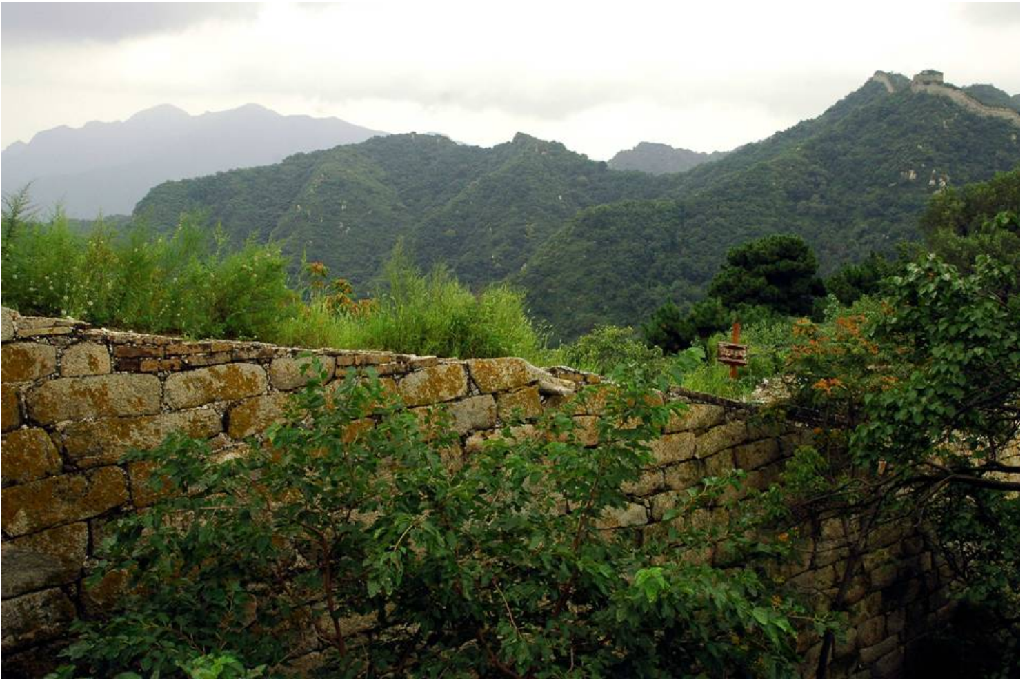
A view of the scenery. Nice day. Cool (in the upper 70s) and a brief spurt of rain.